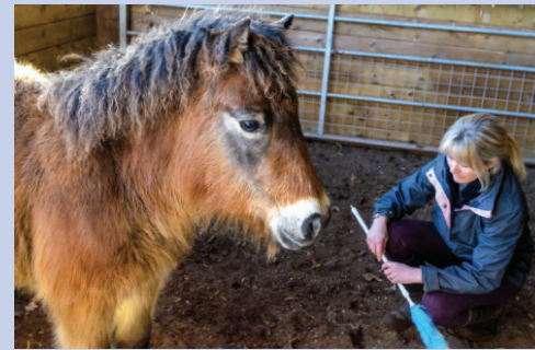
Opposite: A plea for help, staring helplessly at the walker